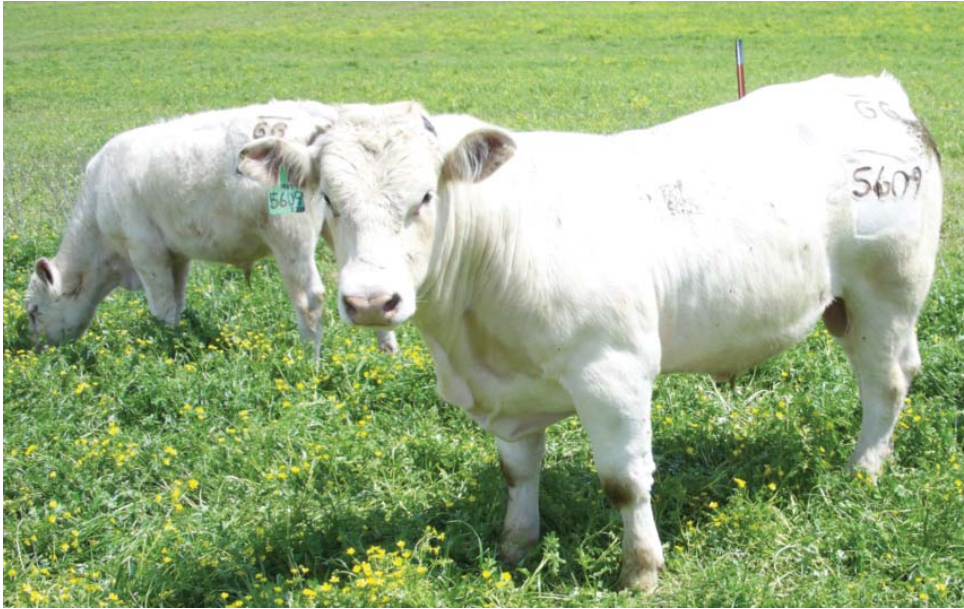
FIGURE 3. The brand on this bull indicates he is the 56th calf from the 2009 calf crop. Using two systems of identification ensures that if the ear tag is lost, the bull can still be identified.

A combination of ear tags and tattoos are used by many cattlemen. The ear tag features easy reading while the tattoo is permanent. In many cases, an animal with a lost tag can have its tattoo read in the head gate and have a blank tag numbered and applied in one operation.