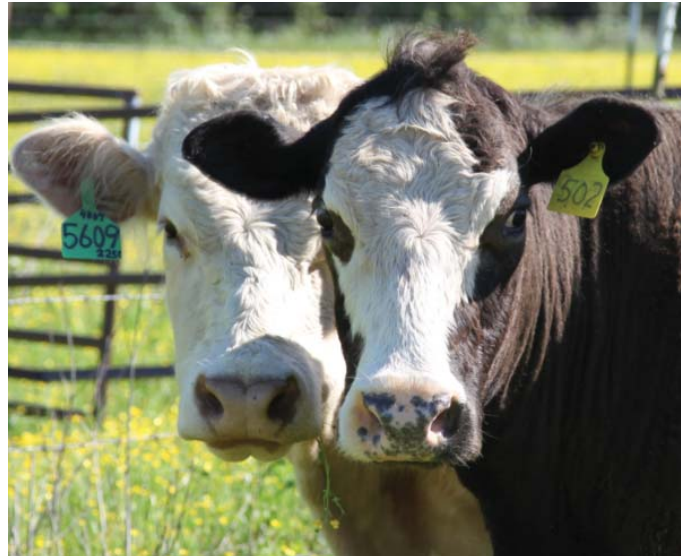
FIGURE 1. Examples of two numbering systems that can be used on ear tags. The white bull in the back is the 56th calf born in 2009 whereas the crossbred cow in the front is the second calf from the 2005 calf crop. The cow was born into the herd while the bull was purchased from another breeder.

Ear tags (Fig. 1) are a popular method of identifying cattle. The larger type tags are easy to apply and are easy to read out in the pasture. The biggest problem with ear tags is loss of tags. Loss of tags may range from less than 10 percent up to 20 percent on an annual basis. However, many cattle will carry a tag for years before it is lost.