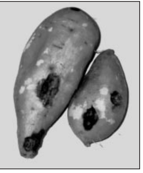
Wireworm/grub damage to sweet potatoes.

Wireworms are the immature or larval forms of click beetles (family Elateridae ). The larval stage lives in the soil and feeds on the potato roots. Adult beetles overwinter in the soil and emerge from mid-April to early June. After mating, female beetles burrow into the soil and lay their eggs. The eggs hatch in three to four weeks. The adults do not feed on the plants but are found near the soil surface under leaves and trash.