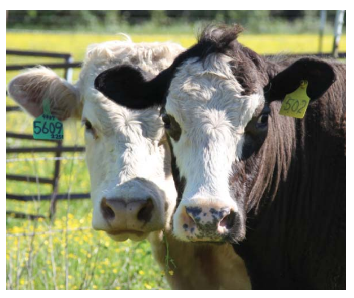
FIGURE 1. Examples of two numbering systems that can be used on ear tags. The white bull in the back is the 56th calf born in 2009 whereas the crossbred cow in the front is the second calf from the 2005 calf crop. The cow was born into the herd while the bull was purchased from another breeder.

Ear tags (Fig. 1) are a popular method of identifying cattle. The larger type tags are easy to apply and are easy to read out in the pasture. The biggest problem with ear tags is loss of tags. Loss of tags may range from less than 10 percent up to 20 percent on an annual basis. However, many cattle will carry a tag for years before it is lost.