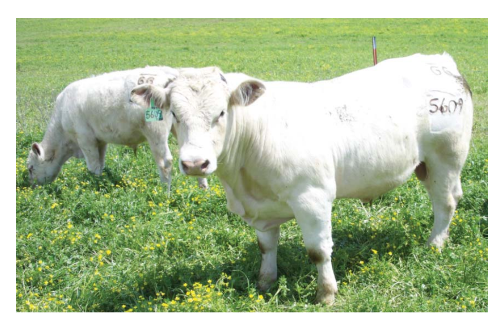
FIGURE 3. The brand on this bull indicates he is the 56th calf from the 2009 calf crop. Using two systems of identification ensures that if the ear tag is lost, the bull can still be identified.

A combination of ear tags and tattoos are used by many cattlemen. The ear tag features easy reading while the tattoo is permanent. In many cases, an animal with a lost tag can have its tattoo read in the head gate and have a blank tag numbered and applied in one operation.