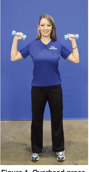
Figure 1. Overhead press starting position.

Note: If you are unable to reach your arms over your head due to surgery or other medical precautions, you can do the side arm raise as an alternate shoulder exercise. The overhead press and the side arm raise both work the shoulder muscle. You do not need to do them both.