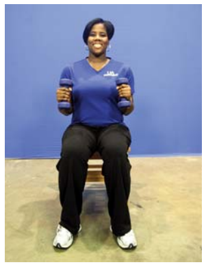
Figure 3. Side arm raise starting position.

Note: As a variation of the biceps curl, you can do this exercise seated and one arm at a time. See Figure 9: Seated Biceps Curl Starting Position and Figure 10: Seated Biceps Curl.