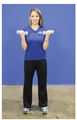
Figure 8. Biceps curl.