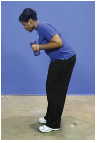
Figure 11. Triceps kickback starting position.

Note: When you are first learning the wide leg squat, you can stand behind a high back chair and hold on for balance.