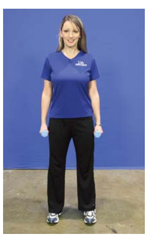
Figure 7. Biceps curl starting position.