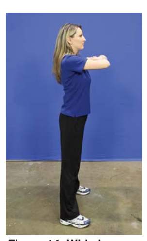
Figure 14. Wide leg squat starting position, side view.