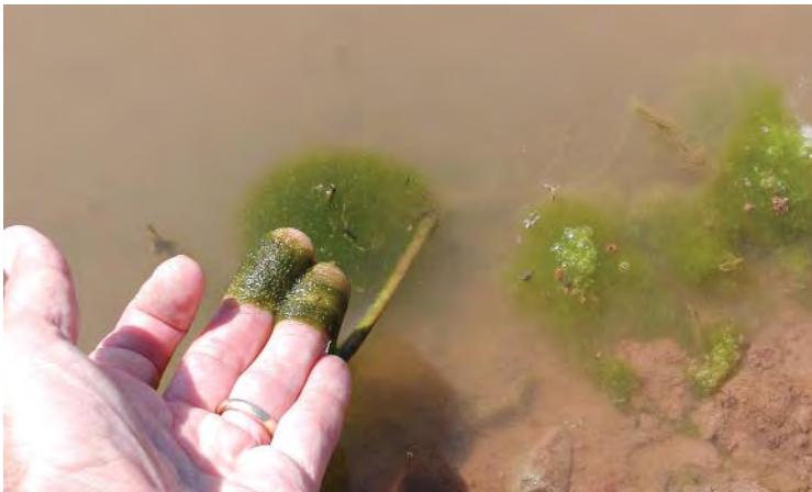
Figure 17. Strands of filamentous algae.