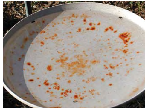
Figure 9. A red algae is commonly found growing in bird baths.