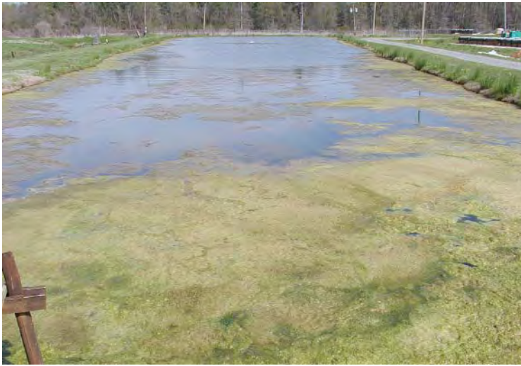
Figure 16. Filamentous algae can form dense mats on the pond bottom and at the surface.