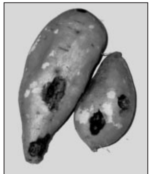
Wireworm/grub damage to sweet potatoes.

Wireworms are the immature or larval forms of click beetles (family Elaeteridae ). The larval stage lives in the soil and feeds on the potato roots. Adult beetles overwinter in the soil and emerge from mid-April to early June. After mating, female beetles burrow into the soil and lay their eggs. The eggs hatch in three to four weeks. The adults do not feed on the plants but are found near the soil surface under leaves and trash.